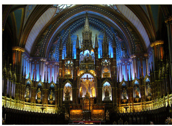
Notre Dame Basilica

Fees for registration received on or before October 2 are $110 for regular members, $55 for students and retirees. After October 2 registration fees rise to $155 for regular members and $80 for students and retirees. You must be a member of the Society for Music Theory to attend the conference.