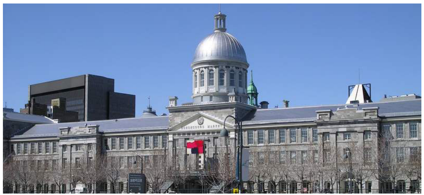
Bonsecours Market in Montréal